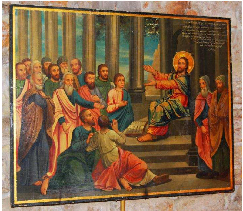
The painting behind the altar in the church in Nazareth that marks the site of the Synagogue where Jesus taught.